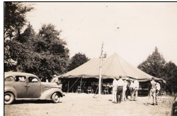
Tent Revival - 1949